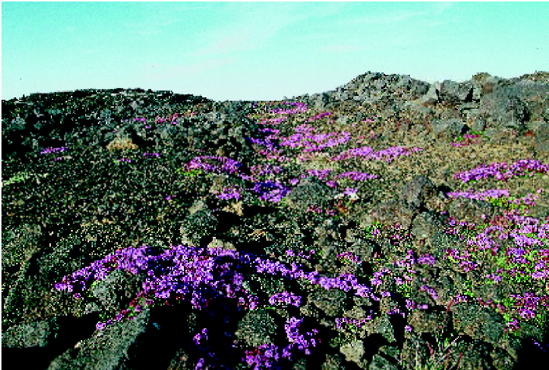
Thyme-covered lava field

While the recommendations stem from a CAFF report, they are by no means directed solely at the CAFF community. Conservation requires the active participation of all sectors of society. These recommendations are presented in the hopes of encouraging greater co-operation and collaboration in Arctic conservation for the shared benefit of all.