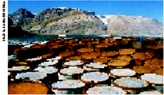
Left-overs from World War II, Northeast Greenland National Park

Tourism is another form of economic development that is increasing, with consequences for the environment. Efforts are underway to develop effective management policies for tourism in the Arctic, focusing on minimizing impacts and respecting local cultures.