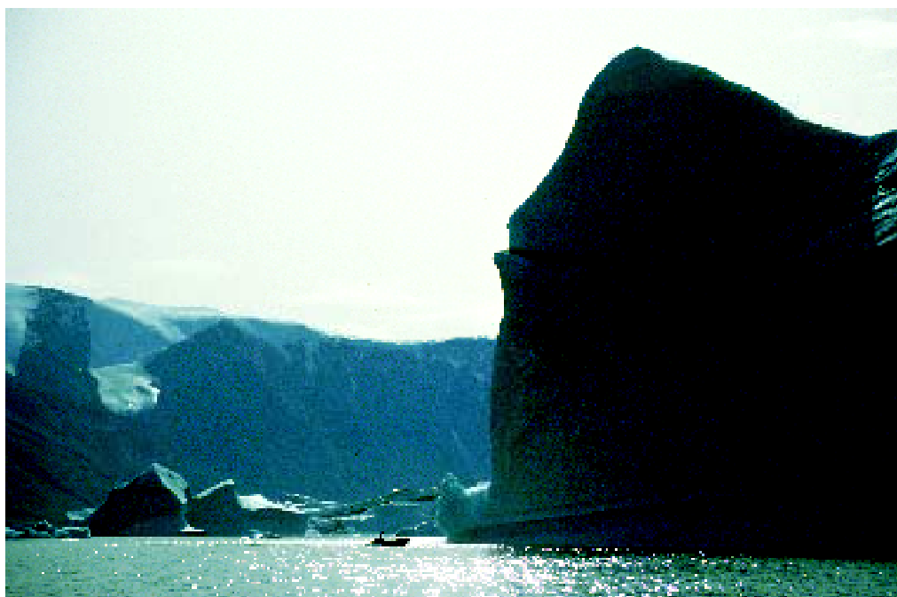
Icescape in Greenland