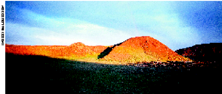
From Hellisheidi, Iceland

The Arctic Council advocates an ecosystem