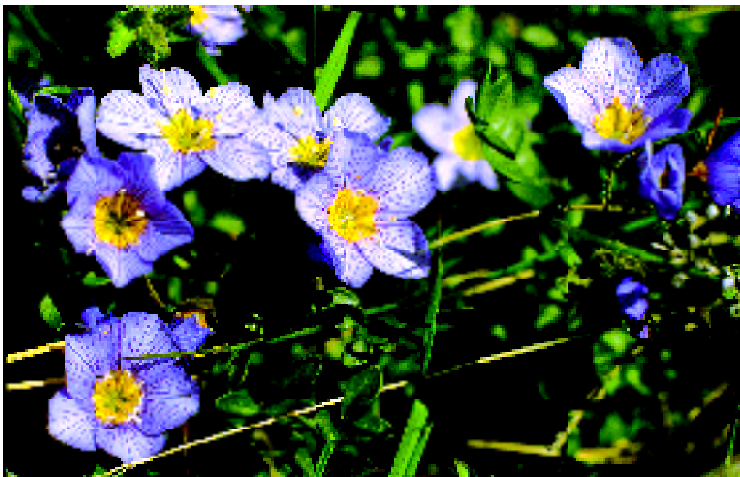
Unidentified wildflower in Denali National Park

Baseline information and data are needed to understand the Arctic ecosystem and its health. This is a prerequisite for sound conservation decisions and actions, and for assessing the effectiveness of such measures. Monitoring programs represent an important instrument in addressing this need.