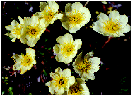
Mountain avens is a circumpolar species

The Arctic has many special and unique features. Many of its stark and beautiful landscapes and seascapes are pristine. Its flora and fauna are distinctive and highly adapted to the cold and dryness that characterize much of the region for most of the year. The many indigenous communities remain linked to their lands and waters, a connection between humans and the environment that is increasingly rare elsewhere. In much of the world, conservation is a matter of protecting what is left, or trying to restore what has been damaged. The Arctic offers a rare opportunity to demonstrate that humans can conserve a region, not as an afterthought, but as a priority.