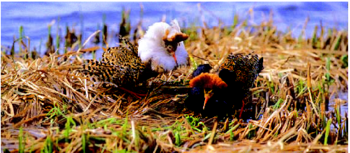
Mating display of ruff in Kevo Strict Nature Reserve, Finland