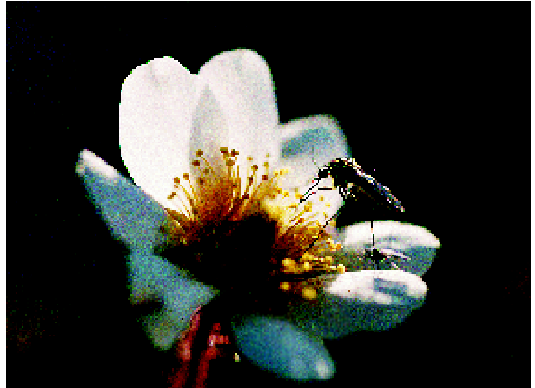
Mosquito on a mountain avens

species is low compared with temperate and tropical ecosystems phenotypic and genetic diversity within species may be high, and some species such as Arctic char can fill several ecological niches. Population ranges tend to be large, and marginal groups of plants or animals at the edge of their range are seen as sensitive indicators of change including global warming. Habitat diversity tends to be high, even over short distances where microclimates can create dramatic differences. However, the relative paucity of species creates additional vulnerability since disruption of one or two species that play vital ecological roles can have serious impacts on the ecosystem. Conservation efforts must take these characteristics into account, including the ways species interact with one another and depend on their physical environment.