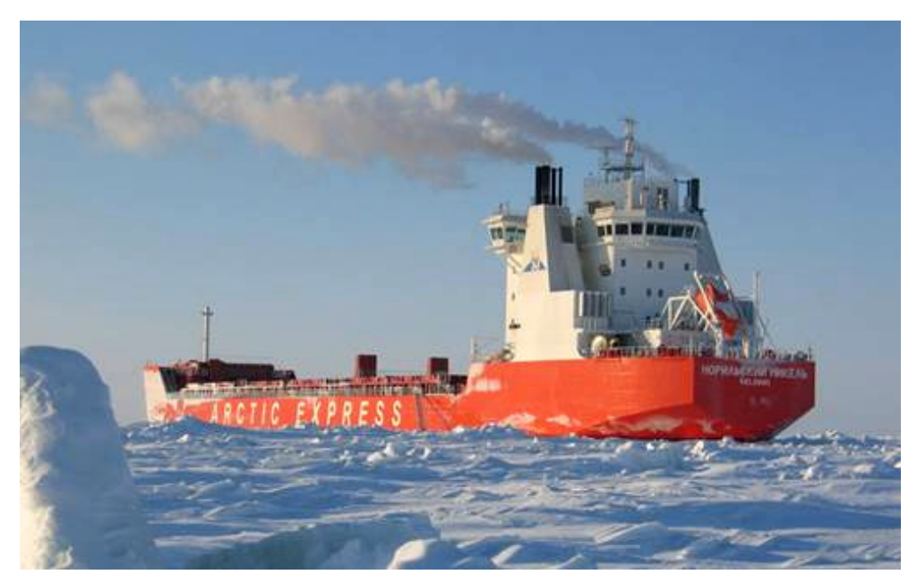
Icebreaking (Double Acting) Container Ship: Norilskiy Nickel on the Northern Sea Route (March 2006)

shown recently that modern icebreaking commercial ships can operate in this region without the need for icebreaker convoying.