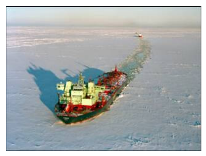
Double Acting Ship Aker Arctic DASTM

The main technological challenges in ship design must take account of the following: