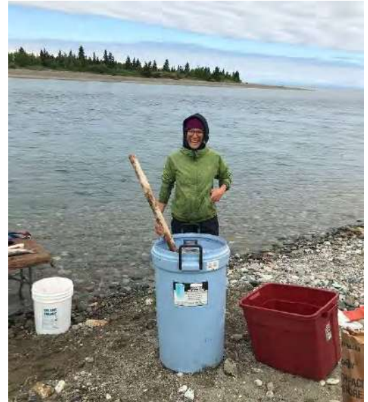
The author preparing fish for preservation.

Therefore, I find that good quality relations are essential to unleash the full potential of transformations, both in research and practice. My research suggests that this can be acquired by employing a 'deep' relational approach to relations, grounded in values of reciprocity and responsibility, what I refer to as 'right relations'. I stress the need to turn to 'deep' relational ontologies and perspectives, and to build bridges between ontologies and knowledge-systems. This is crucial to co-create knowledge that can inform both the theory and the practice of deliberate sustainability transformation. Furthermore, the bridge-building must respect different worlding practices and acknowledge the entangled co-becoming of humans and nonhumans as inhabitants of planet Earth.