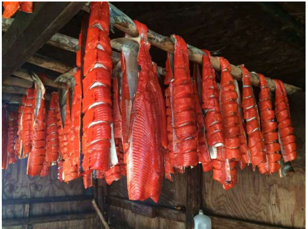
Smoking of salmon in traditional vessel.

The research for my thesis was based on a collaboration with the Yup'ik community of Igiugig in southwest Alaska. Igiugig is a small Alaska Native village of 70 people, located where Lake Iliamna is swallowed by the Kvichak River, at the intersection of Yup'ik, Dena'ina and Alutiiq homelands ( www.igiugig.com ). Previously, as a master's student at the University of Alaska Fairbanks (2010-2012), I had collaborated with people in Igiugig. Thus, returning to the village in 2017, this time as a PhD student, felt very meaningful to me as it enabled me to honor my commitment to the relationships initiated five years earlier.