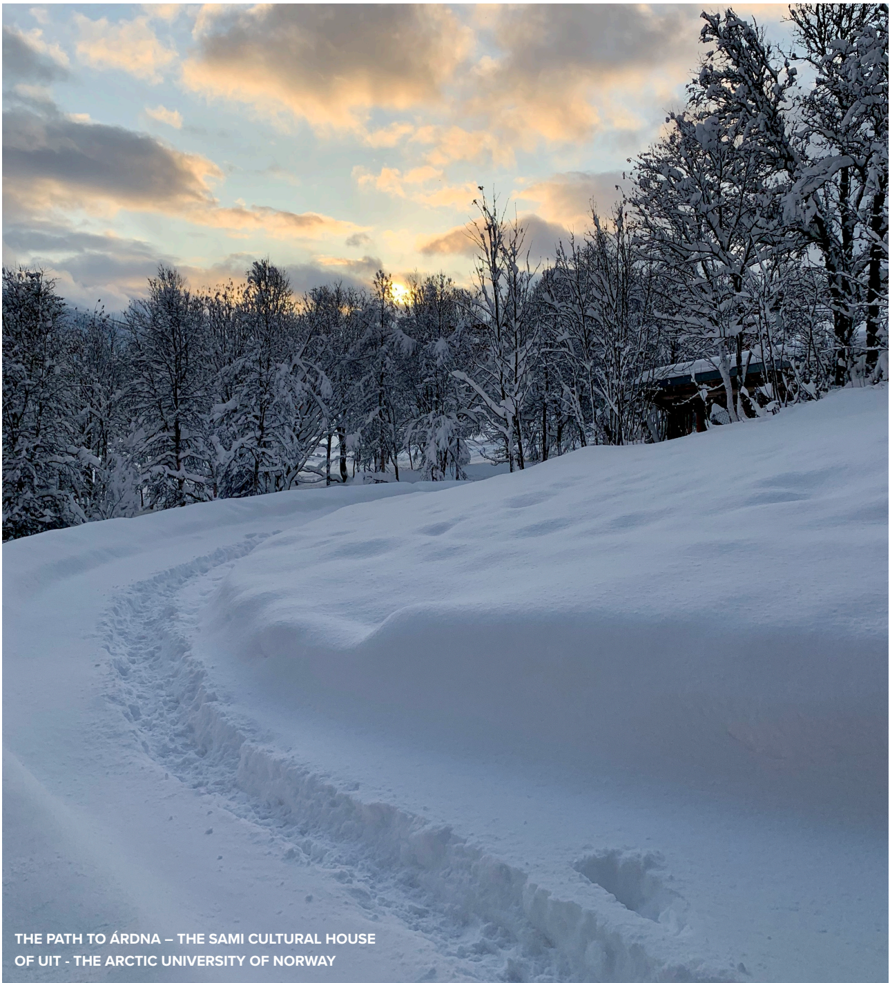
THE PATH TO ÁRDNA – THE SAMI CULTURAL HOUSE OF UIT - THE ARCTIC UNIVERSITY OF NORWAY